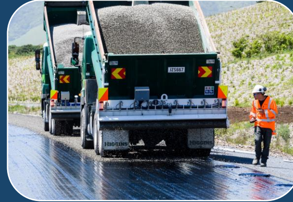
Increased maintenance and resilience