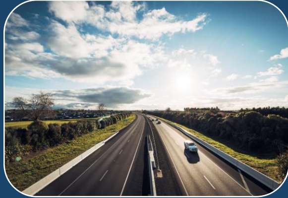
Economic growth and productivity