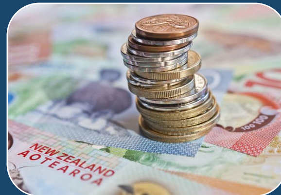
Value for money