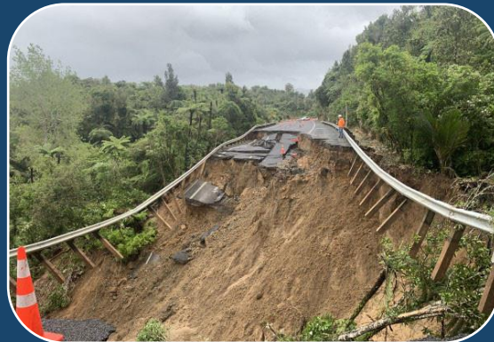
30 Jan 2023