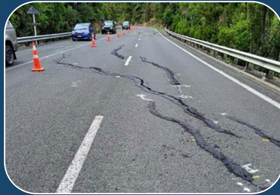
18 Jan 2023 - cracking