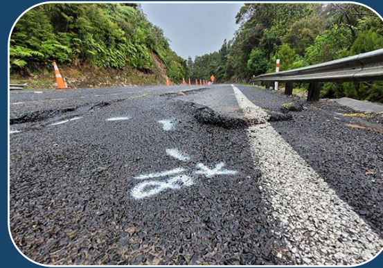
27 Jan 2023 - cracks widening