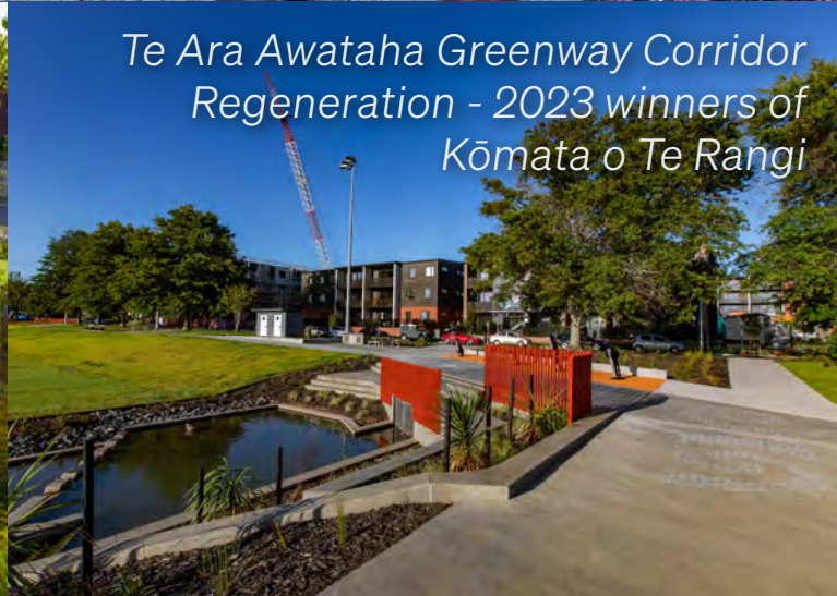
Te Ara Awataha Greenway Corridor Regeneration - 2023 winners of Kōmata o Te Rangi