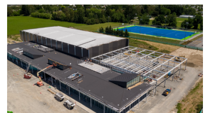
Above: Rangiora multi-use indoor stadium