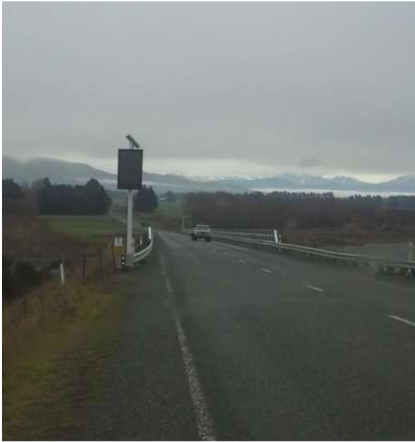
Cyclist Activated Warning Signs