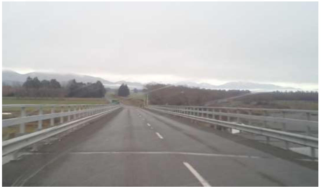
Guard Rail Extensions